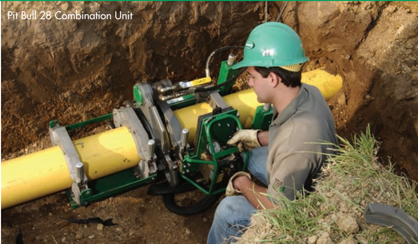
Pit Bull 28 Combination Unit

Fusion Capability for 2" IPS to 8" DIPS (63mm - 225mm)