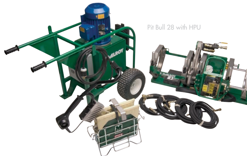
Pit Bull 28 with HPU

Pit Bull 28 includes fusion carriage, heater, facer and insulated heater stand. HPU that includes extension hoses and lifting assembly sold separately. Specifications are subject to change without notice.